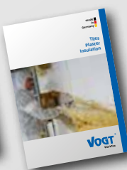
Tiles Plaster Insulation