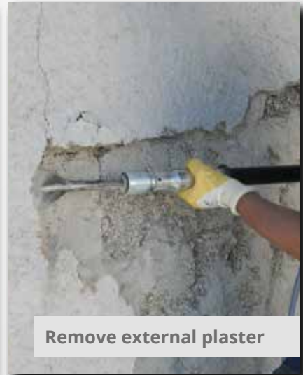
Remove external plaster