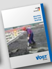
Bitumen Flat roof Sealings