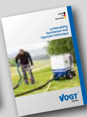
Landscaping Aeration and injection technique

VOGT Baugeräte GmbH Industriestraße 39 D-95466 Weidenberg