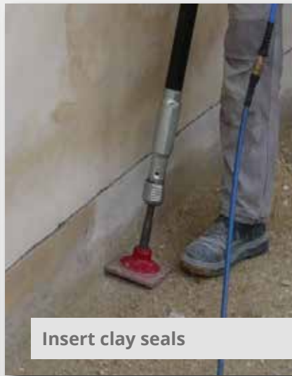
Insert clay seals