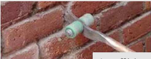
Lay off joints