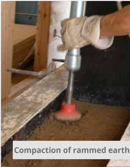
Compaction of rammed earth