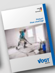
Parquet Floor coverings