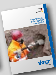
Underground- drain- pipeline construction