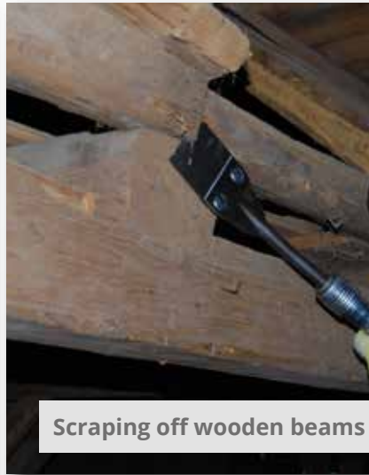
Scraping off wooden beams